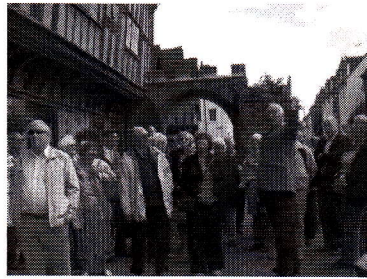
Group outing to Warwick 2011